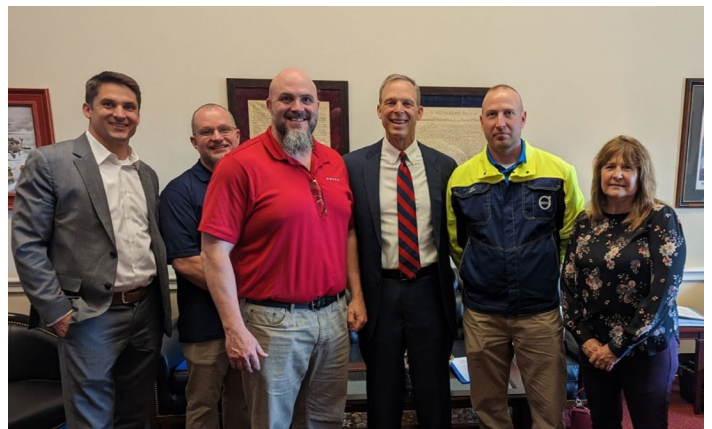
Rep. Perry (striped tie) with employees from Volvo Construction Equipment.